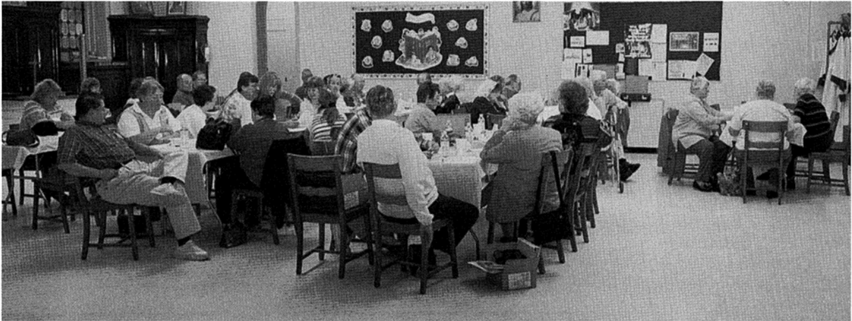
Fig. 3 Gathering of the attendees